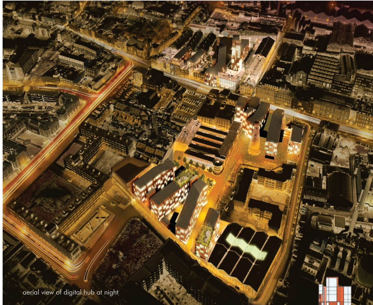
aerial view of digital hub at night

Enterprise: City Centre Insertion in association with McCullough Mulvin Architects