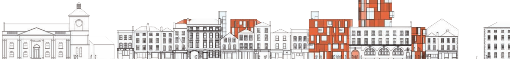
thomas street elevation looking south